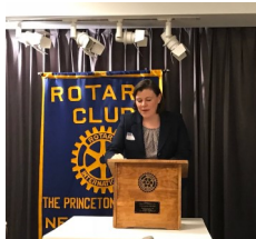
Homefront Diaper Drive