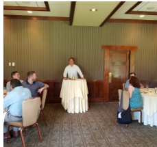
First in person meeting Salt Creek Grille