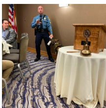
K9 Unit Princeton