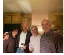
End of Year celebration