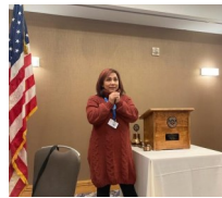
Homefront & Thanksgiving Baskets