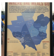
United Way - Strike Out Hunger