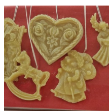
Holiday Ornament Fundraiser